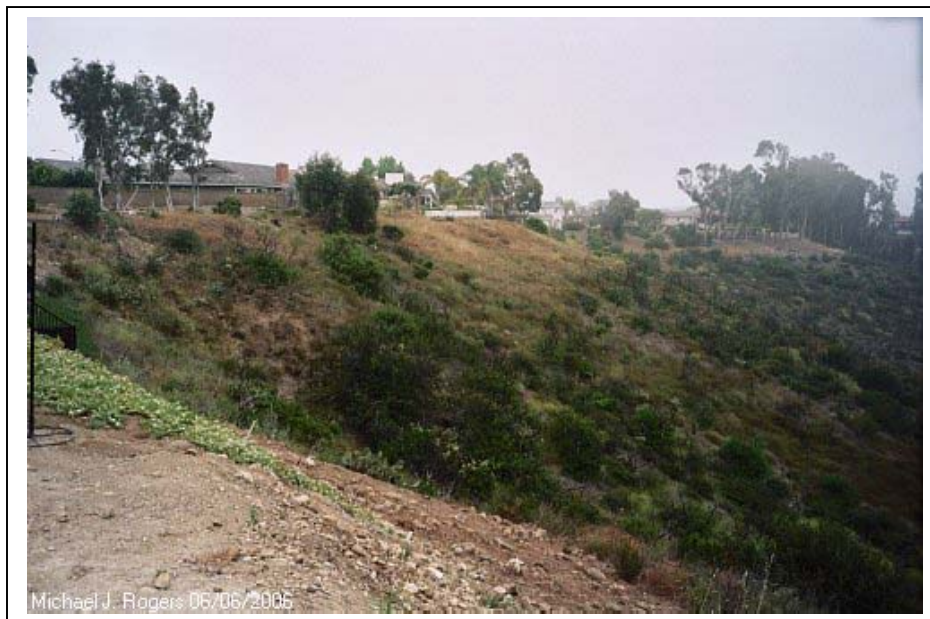
Photo #16: Because of the 100% slopes, eucalyptus seedlings invading the burned areas and eventual Fuel Model 4 chaparral; 200' of fuel modification is needed between the back of the homes and undisturbed native vegetation. This slope burned and is rapidly recovering. Most of the destroyed homes in this area have been or are being rebuilt.