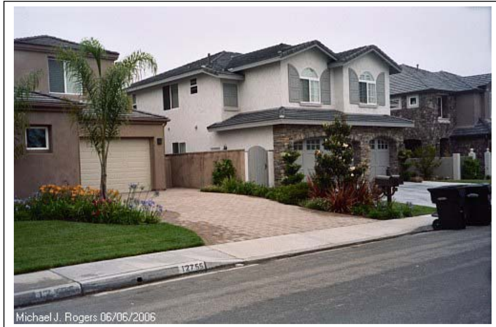
Photo # 17: From the street all looks well, however, all of these homes burned when the canyons out behind these homes, as depicted in photo 16, burned in the early morning hours of October 26, 2003 in the Cedar Fire driven by extremely dry, unrelenting Santa Ana winds. Again, these brand new code compliant, fire resistant homes are being severely compromised by the attached wooden fencing and inappropriate landscaping, such as the highly flammable pine trees. Pyrophytes, plants that have high oil or resin content, such as pines, firs, cedars, junipers, cypress, eucalyptus and some palm species SHOULD NOT be planted within 100' of structures.