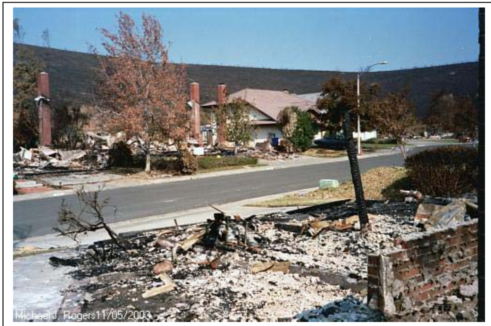
Photo #6: All the other homes on Meadowdale Lane had shake roofs and shake siding in accordance with the Scripps Ranch Community Plan.