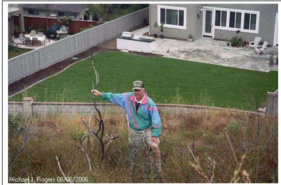
Photo #13: This individual is 6' in height. The skeletons from the chaparral vegetation left from the 2003 Cedar Fire are over 6' in height. The wooden privacy fences are not a problem except where they attach directly to the structure. A minimum 5' noncombustible transition wall or fence is required by the Building Code. There are no required transition walls.