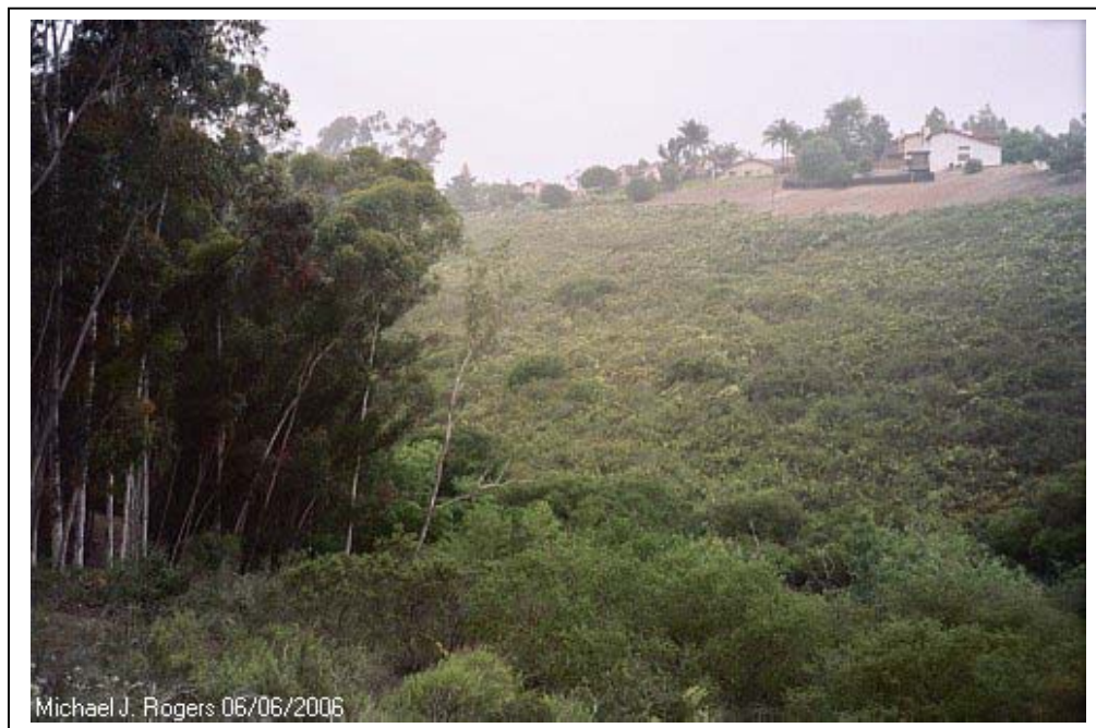
Photo # 18: Many unburned areas still pose a threat to the Community of Scripps Ranch. Fortunately the Chimney Canyon Firesafe Council has initiated action to reduce the extreme risks to the greater community through grants from the US Forest Service and a host of community partnerships with organizations such as the California Conservation Corps and others.