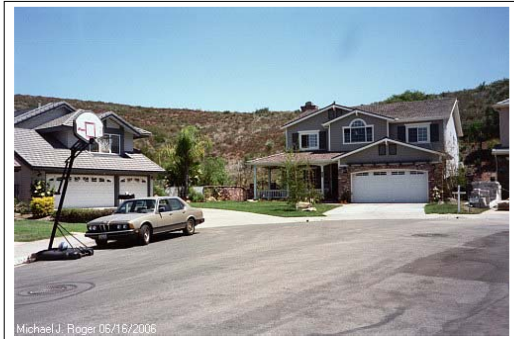
Photo #9: The home to the right of the surviving home has been rebuilt. In just 2 years the chamise is rapidly revegetating the slopes behind the homes as is the eucalyptus. These slopes will soon be fully revegetated in a Fuel Model 4 highly flammable chaparral shrubs.