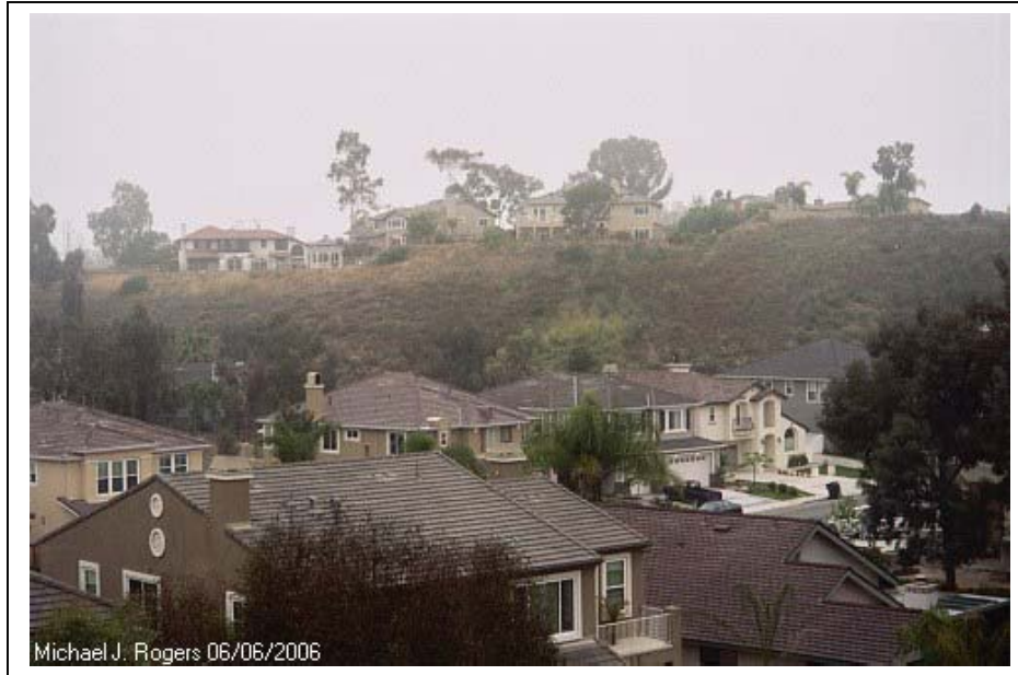
Photo #15: There are several open space areas that did not burn in the 2003 Cedar Fire that will burn in a future wildfire. The impacts from radiant heat can be neutralized by well maintained fuel modification zones and fire resistant structures. The use of goats in the fuel modification zones as measured 200' horizontally from the back of the structure is a viable option. The impacts from wind blown embers can only be compensated for by having fire resistant structures.