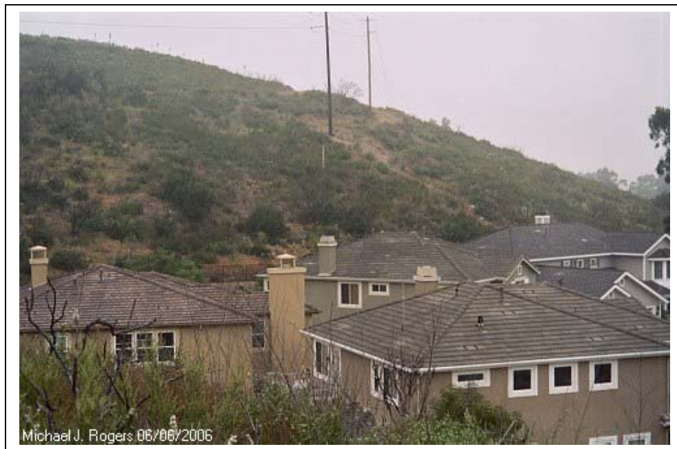
Photo #14: These newly rebuilt homes will be subjected to intense radiant heat from the next wildfire without adequate fuel reduction. This is an ideal situation for goats. Herded goats will reduce the volume of standing vegetation but leave the ground cover intact, which prevents erosion.