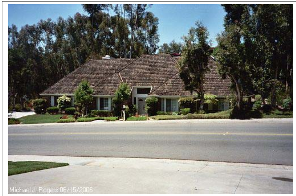
Photo # 19: This wood shake roofed structure is only one of many that still exist within the Community of Scripps Ranch. The combination of highly volatile eucalyptus and wood shake roofs make this structure susceptible to ember laden winds blowing into Scripps Ranch from fires a mile or more away from Scripps Ranch. This particular structure, along with several others, is at the intersection of Semillion Blvd and Spruce Grove Avenue. In addition to retrofitting the structure, all eucalyptus within 200' of any structure in Scripps Ranch should be removed. Follow up treatments will be needed for several years to kill returning sprouts and seedlings.

There are still a large number of homes that require retrofitting to Class A roofs, fire resistant siding, double pane windows and modifications to the current landscaping around these homes.