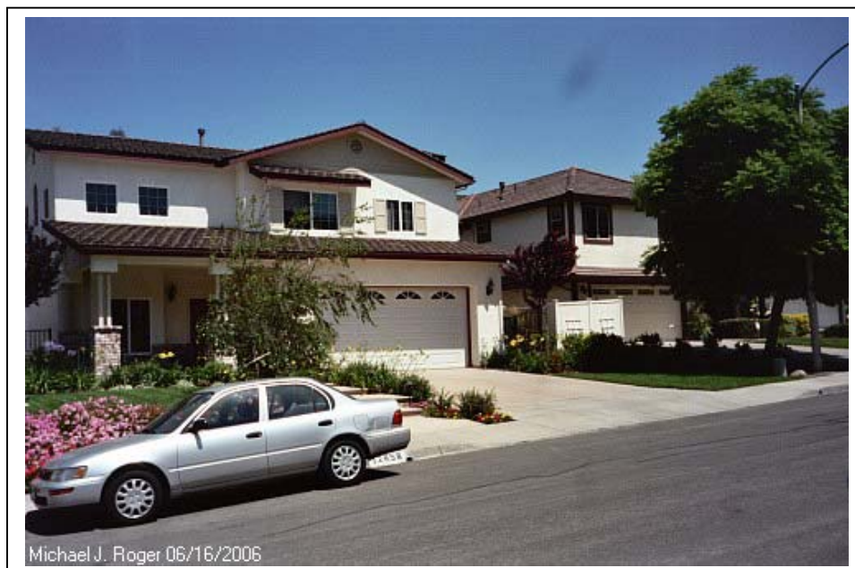
Photo #8: This Photo corresponds to photo No. 6. The home on the right is the survivor at 12868 Meadowdale Lane. The home on the left burned to the ground and has been rebuilt. The badly scorched street tree survived.