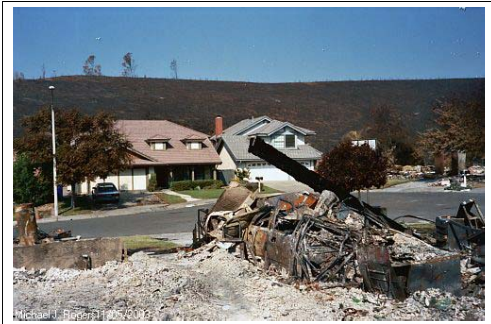
Photo #4: The only two homes that survived on Meadowdale Lane. Both had been remodeled just prior to the 2003 Cedar Fire.