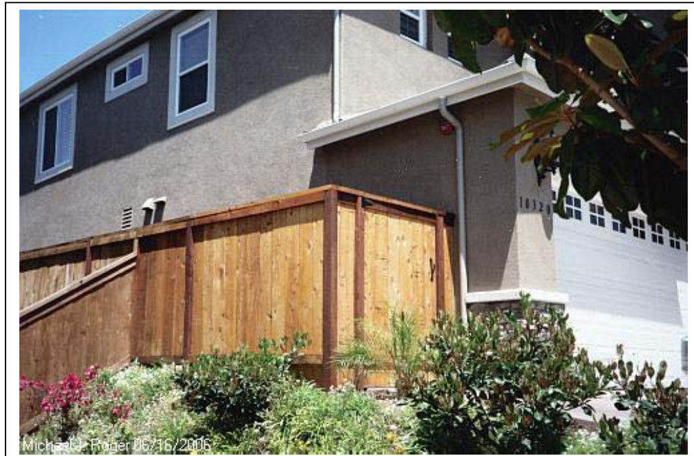
Photo #10: Highly flammable wood fences are being attached to structures directly beneath the eaves.