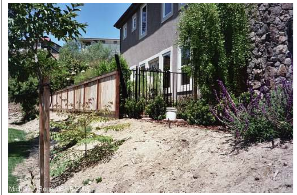
Photo #11: This is an example of a noncombustible fence solution that meets the Building Code and poses no threat to the structure should the side yard fencing burn in a future wildfire.