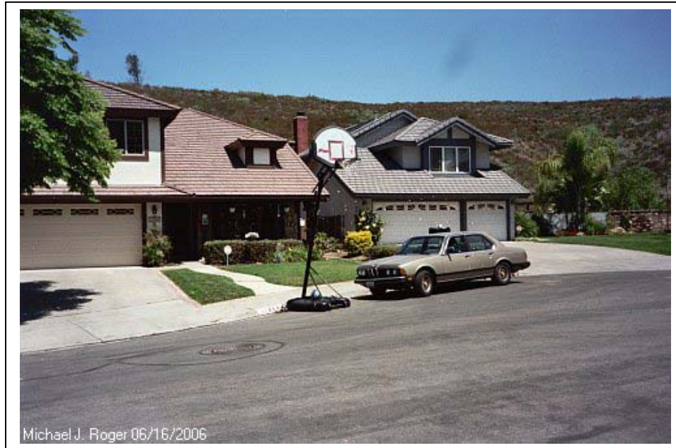
Photo #7: These are the two homes that survived the 2003 Cedar Wildfire. All of the other destroyed homes have now been rebuilt. Note the regrowth behind the homes.