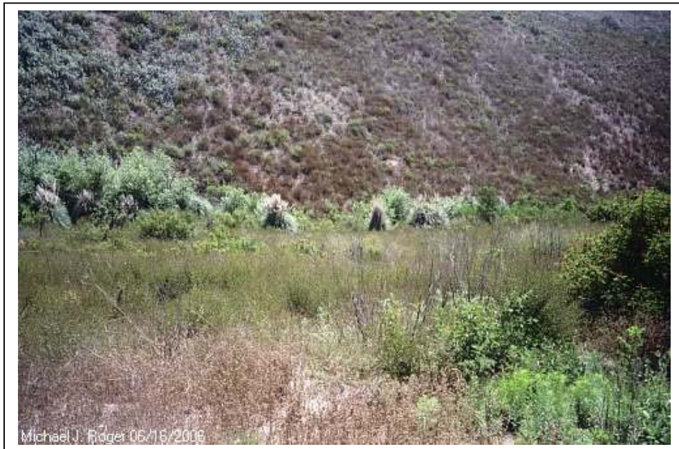
Photo #12: The canyons are also being choked with highly invasive, highly flammable species such as pampas grass. This highly invasive vegetation is not only an extreme fire hazard, it also displaces critically scarce riparian corridors essential to a variety of wildlife by sucking up all of the available water.