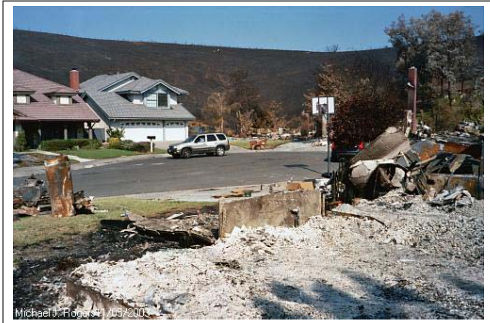
Photo #5: The reddish roofed home is at 12868 and the gray home is at 12878 Meadowdale Lane. Note the lack of vegetation on the hill behind the homes following the Cedar Fire.