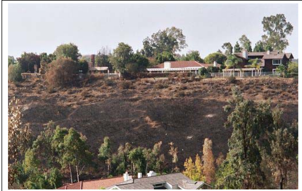
Photo #3: One of the many interior islands of chaparral that ignited because of burning debris and embers that fell into these areas. The home on the right hand side of the photo had a new fire resistant roof, but still has shake siding, however, did not burn. The second home to the left of the shake sided home had a shake roof and burned to the ground.