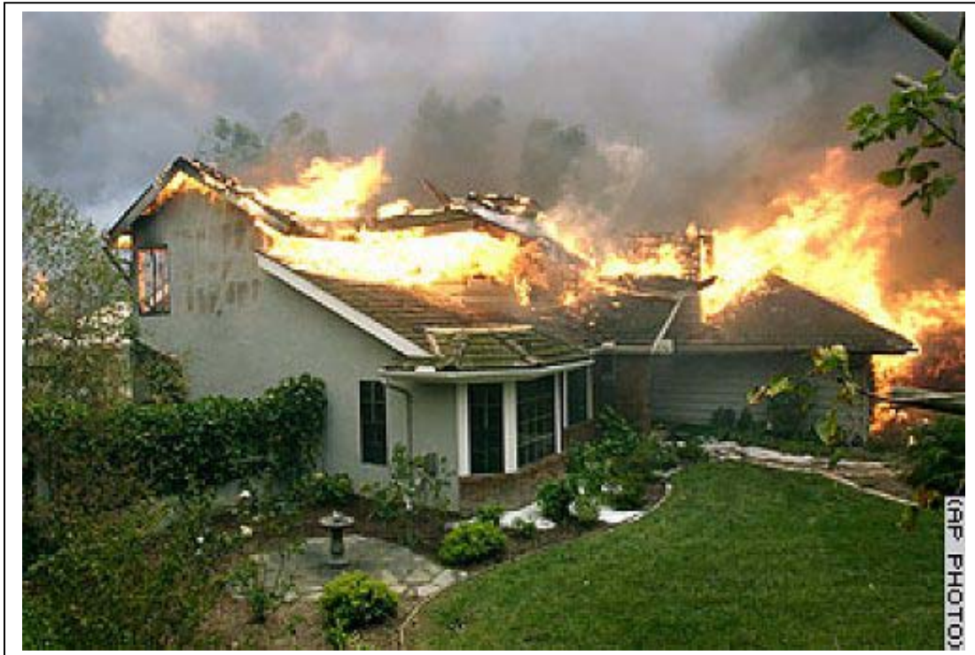
Photo #2: One of the hundreds of shake roofed homes like those in Scripps Ranch on October 26, 2003. These homes typically ignite by windows blowing in due to radiant heat and or embers landing on highly combustible roofing materials.

By 7:00 AM the fire had begun burning westerly and was impacting the Poway, Scripps Ranch areas. Homeowners were ordered to evacuate. Over 300 homes were destroyed within the Scripps Ranch Community.